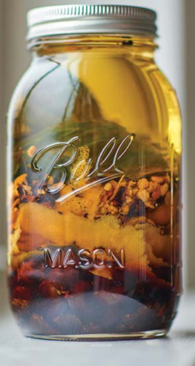
◀ A Ball Mason jar with 151 proof Everclear and macerated ingredients, including dried cherries, orange and lemon zest, basil, sage and ground dry herbs. ▼ A mortar and pestle with dry ingredients for a summer amaro recipe, including wild cherry bark, dried orange peel, anise seeds and grains of paradise.