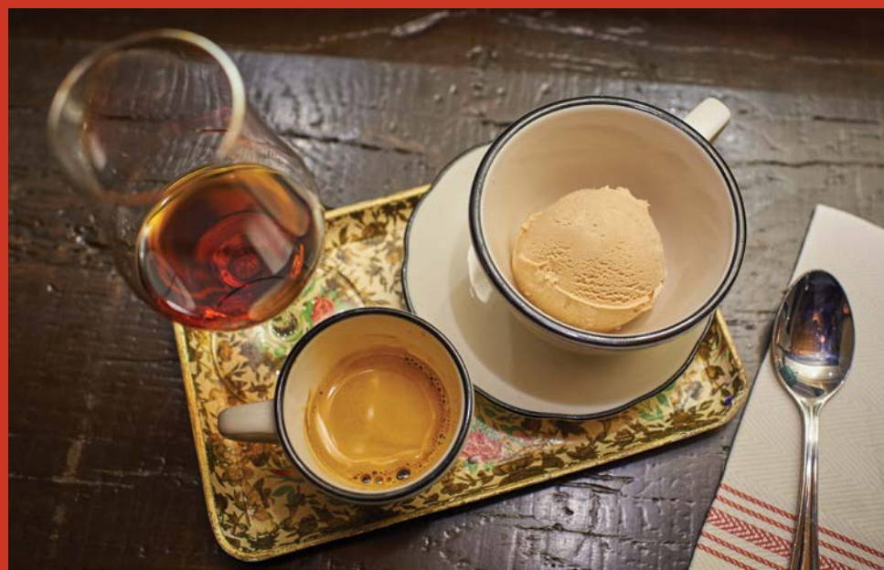
▲ The “Affogato Corretto,” at LUCA, served with a scoop of gelato, hot espresso and a small pour of Amaro Sibona, offering notes of dry cherry cola, orange peel and botanicals.

Hydroponics, as well as dried herbs from The Herb Shop. I found the rarer varieties of wild cherry bark, wormwood and seeds of paradise at nearby Herbs from the Labyrinth.